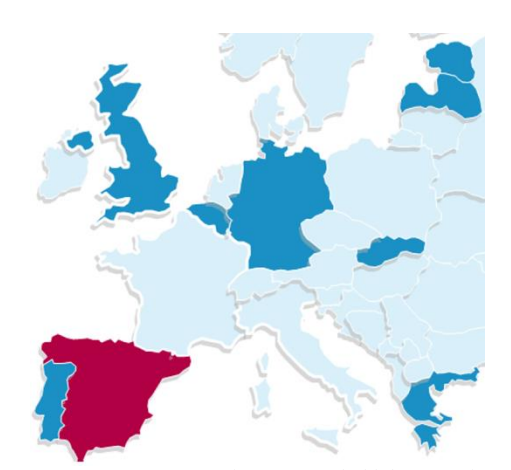
Fig. 2 RAYUELA's consortium map. In bold the countries where the project has footprint.

The consortium includes LEA (Law Enforcement Agencies), large industry companies and SME (Small to Medium Enterprise), research and academia, and educational institutions and associations. It stands out for its interdisciplinarity, bringing together LEAs, sociologists, psychologists, anthropologists, legal experts, ethicists, philosophers, educators, and computer scientists and engineers, as Fig. 3 shows.